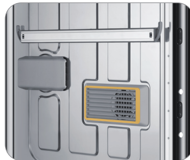
Smart Dry with AutoRelease™ Door

Fingerprint Resistant Navy Steel (panel sold separately)